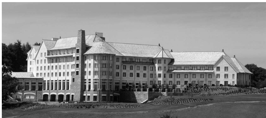
The Inn on Biltmore Estate was the perfect setting.....

Both speakers emphasized the role of the clinical judgment and experience of the clinician and the patient's preferences in applying the best available evidence. Attending Diplomates were eager to determine how this new understanding of evidence-based dentistry will impact the teaching of literature in Advanced Specialty Education Programs in Endodontics and the distribution of awards by the AAE Foundation, and how they could use it in the mentoring of eligible candidates to successfully complete the board certifying process. Course evaluation forms rated the sessions as superior with many comments that it was "the best they had ever attended."