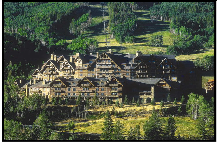
The Ritz Carlton Bachelor Gulch, where the spirit of the Rocky Mountains takes shape in a luxury resort of excep-

Whoever said “It’s the journey, not the destination” never stepped foot in the valley that is home to one of the most magical places in the Rocky Mountains — Ritz Carlton Bachelor Gulch. For 4 glorious months each year, moguls and powder are replaced by columbines and daffodils as the hillside transforms itself into a kaleidoscope of color practically overnight. Whether golfing or mountain biking past a seemingly endless forest of evergreens, or having the weight of the world lifted from your shoulders in the luxurious spa, you may forget when you’re supposed to return home. Which is fine, since you’re stepping into another world — a world where your only job is to have fun. The world of summer in Bachelor Gulch — your final destination. ♦