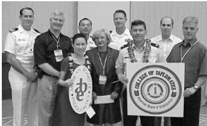
New Diplomates pose at the Grossman Luncheon at the Annual Session in Hawaii. All new Diplomates were honored and awarded complimentary membership for one year in the College of Diplomates.