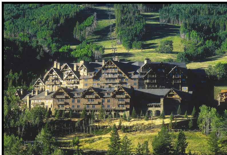
The Ritz Carlton Bachelor Gulch, where the spirit of the Rocky Mountains takes shape in a luxury resort of exceptional beauty.

Look for your registration packet in early 2004.