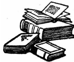
Author of over 100 scientific papers and several classic textbooks.....